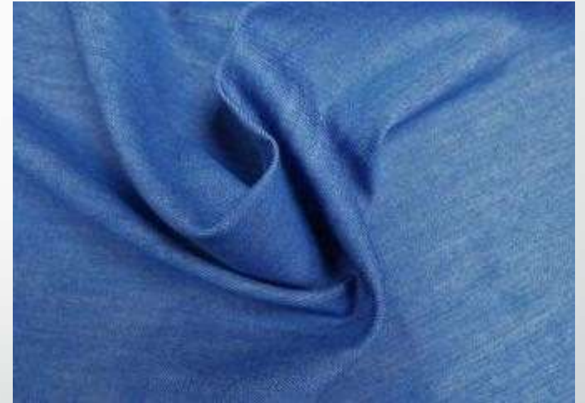
Cotton Poly Fabric (30*150)