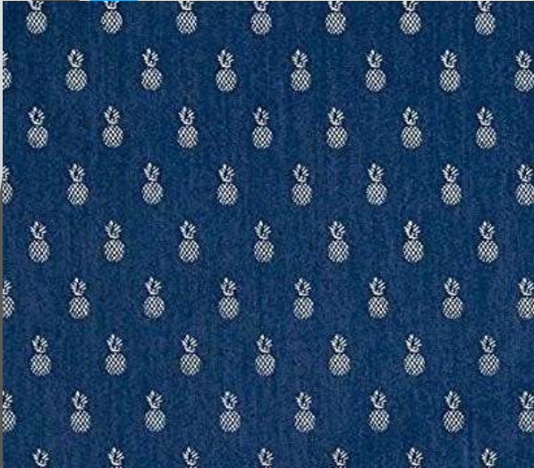
Printed Denim Fabric