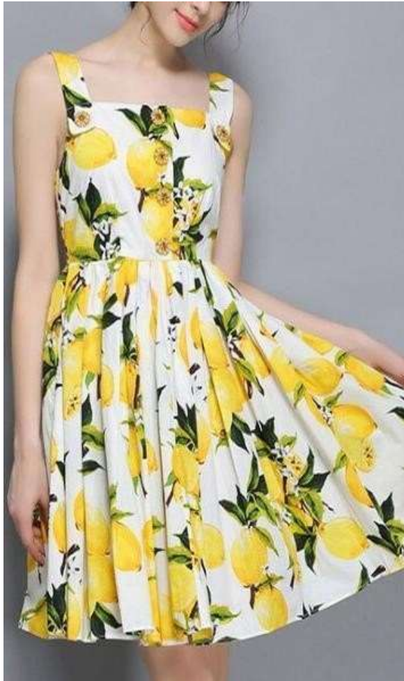
Printed Poplin Fabric