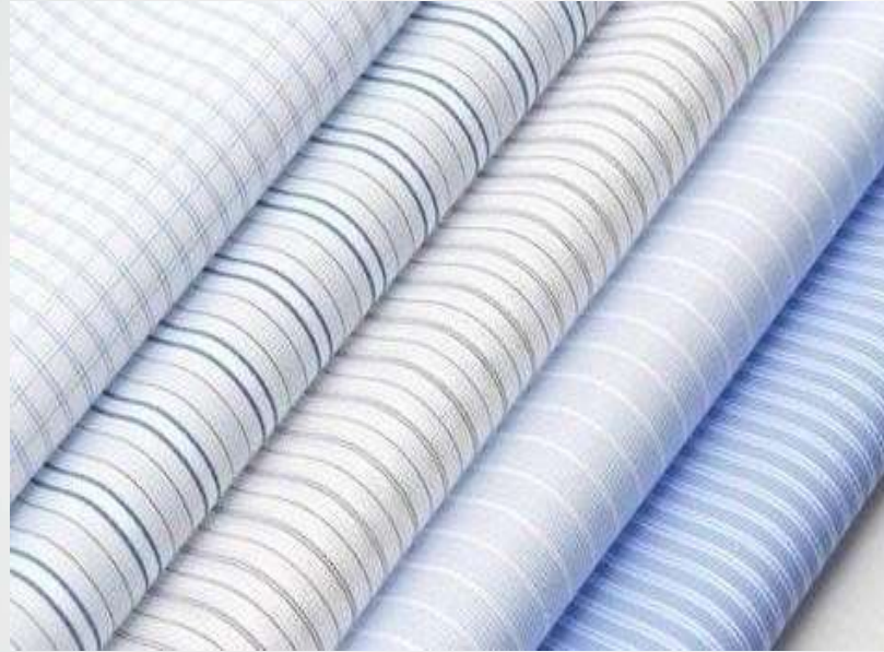
Strip Cotton/Poly Cotton Shirting Fabric