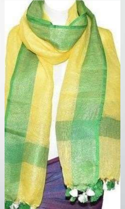
Semi Lienen Dupatta