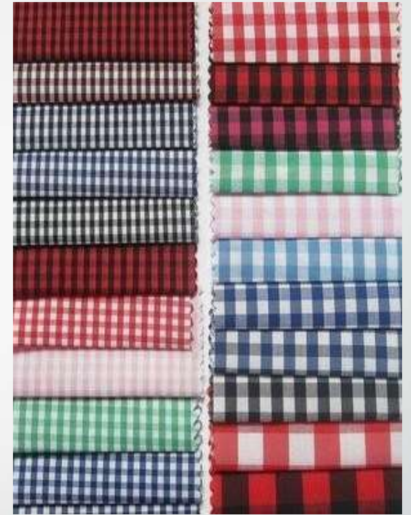
School Uniform Fabric