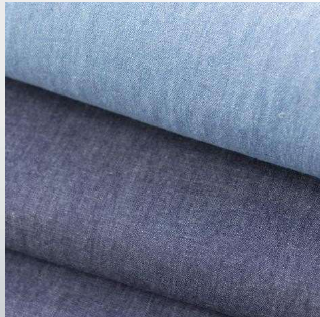
100% Cotton Denim Fabric (30*30)