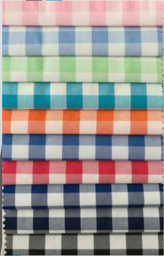
Cotton yarn checks