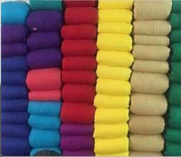
Dyed Viscose/Reyon Fabric