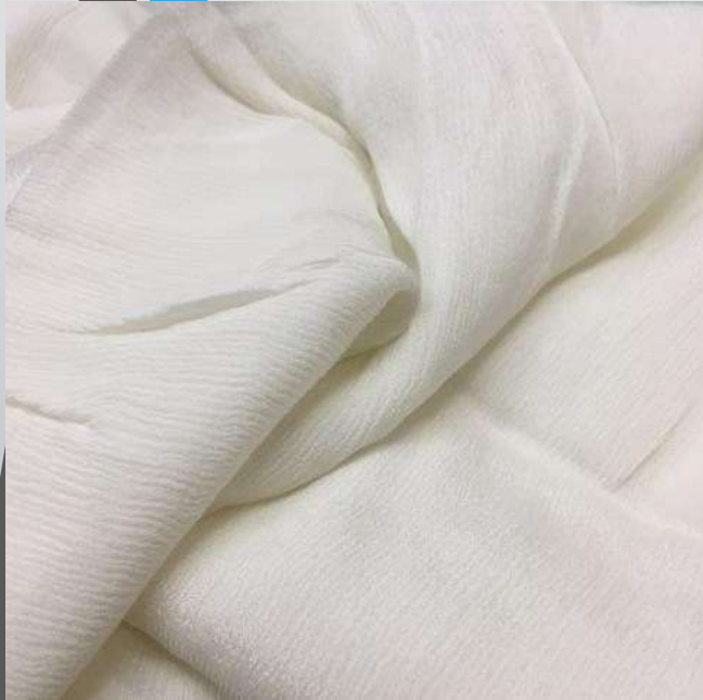
Nazneen Dyeable Fabric