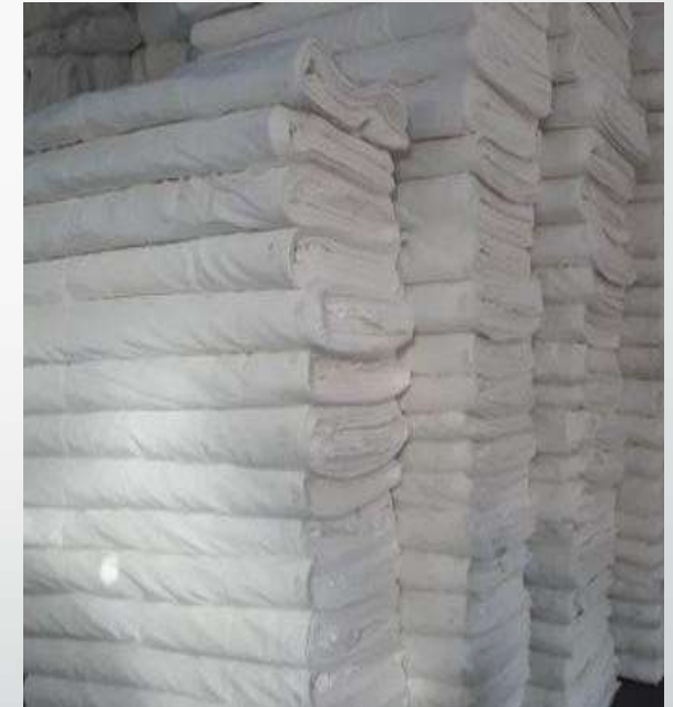
Grey Viscose/Reyon Fabric